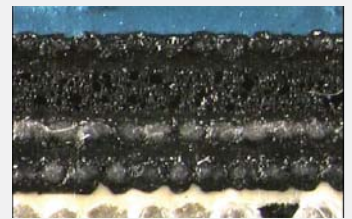
Vulcan Royal Web K2